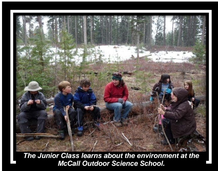
The Junior Class learns about the environment at the McCall Outdoor Science School.

Aristotle once said, "For the things we have to learn before we can do them, we learn by doing them." It is not uncommon for Foothills faculty to receive letters and comments from past alumni. It is always interesting to hear what students